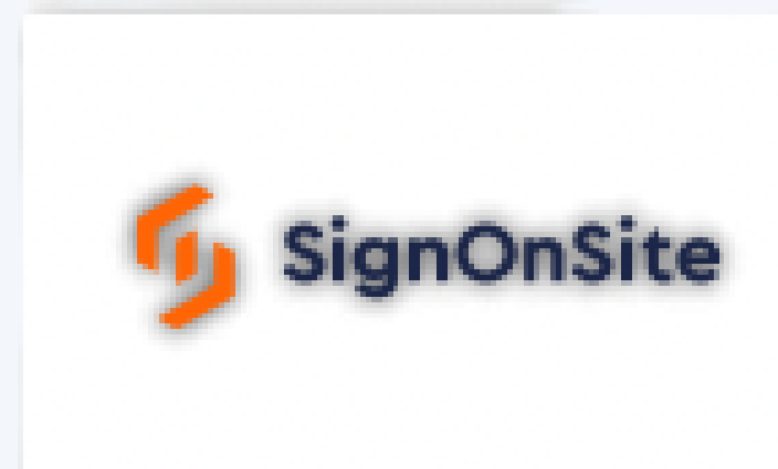
AVOID USING DROP SHADOWS